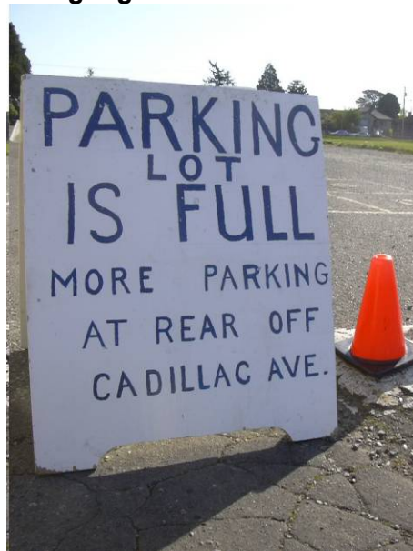
Figure 3 Overflow Parking Sign

Remote parking requires providing adequate use information and incentives to encourage motorists to use more distant facilities. For example, signs and maps should indicate the location of peripheral parking facilities, and they should be significantly cheaper to use than in the core. Without such incentives, peripheral parking facilities are often underused while core parking is congested.